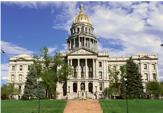
Colorado legislators are back in session to consider new bills.

The Colorado Legislature is back in session, and once again faculty from the Skaggs School of Pharmacy and Pharmaceutical Sciences are working closely with lawmakers to provide their expertise on the opioid crisis.