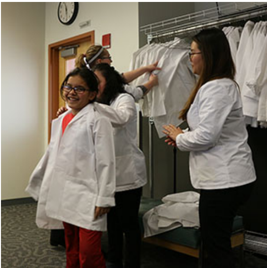
4th grade student receives "Future Pharmacist" white coat during closing ceremony.

Approximately 280 4th graders from local elementary schools in Aurora visited campus over winter break to participate in the award-winning and ever-popular event called "Pharmacist for a Day." A spin-off of the Service Learning Program, this event is a way to engage youth in health education while providing pharmacy students the opportunity to develop their skills as healthcare professionals. Translating pharmacy education into something that is both accessible and meaningful to diverse groups of children proves to be a valuable exercise in effective communication. Learn more